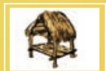
HISTORIC SITE VISIT