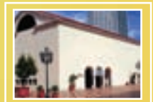
HELD AT HMSF